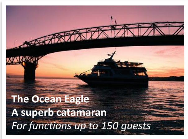
The Ocean Eagle A superb catamaran For functions up to 150 guests